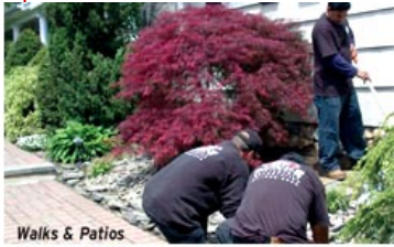
Walks & Patios